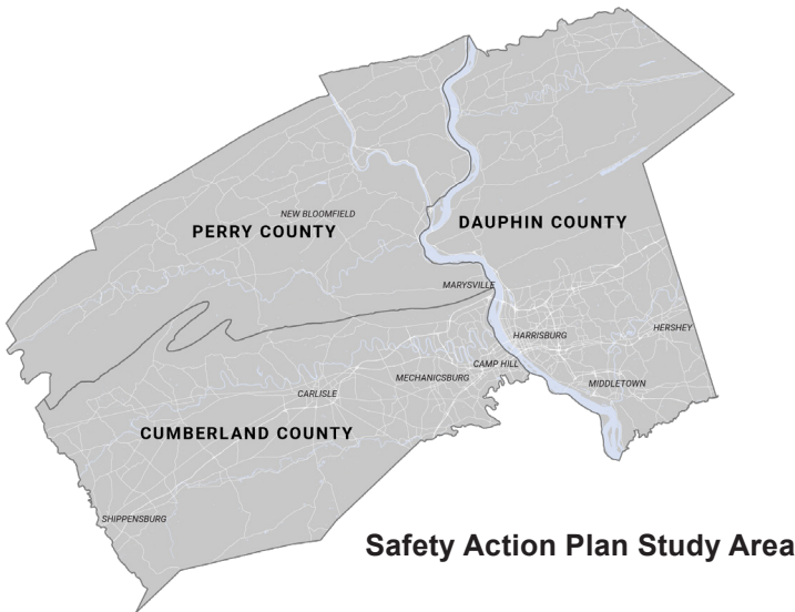
Safety Action Plan Study Area